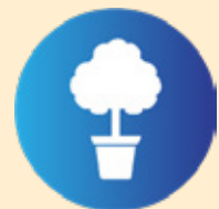
Energy and environment

Finally, the handover of the 2019 ECCP Advocacy Papers will highlight the conference as ECCP shares its highly anticipated wishlist of policy reforms to further create a level playing field and ease doing business in the country.