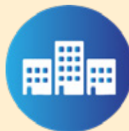
Infrastructure and transportation